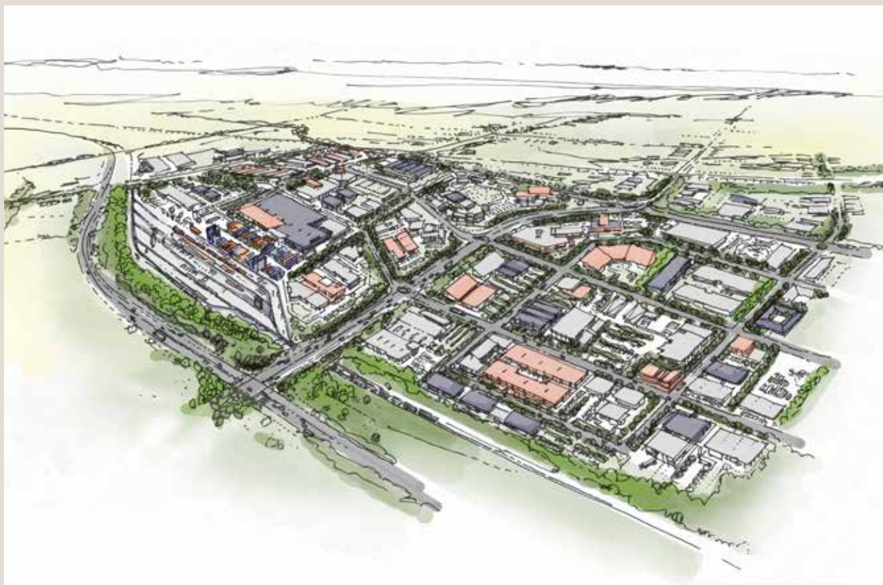
Southern Intermodal Terminal Concept

Until the final Structure Plan is implemented and land is rezoned, the current planning controls remain and existing lawful activities may continue.