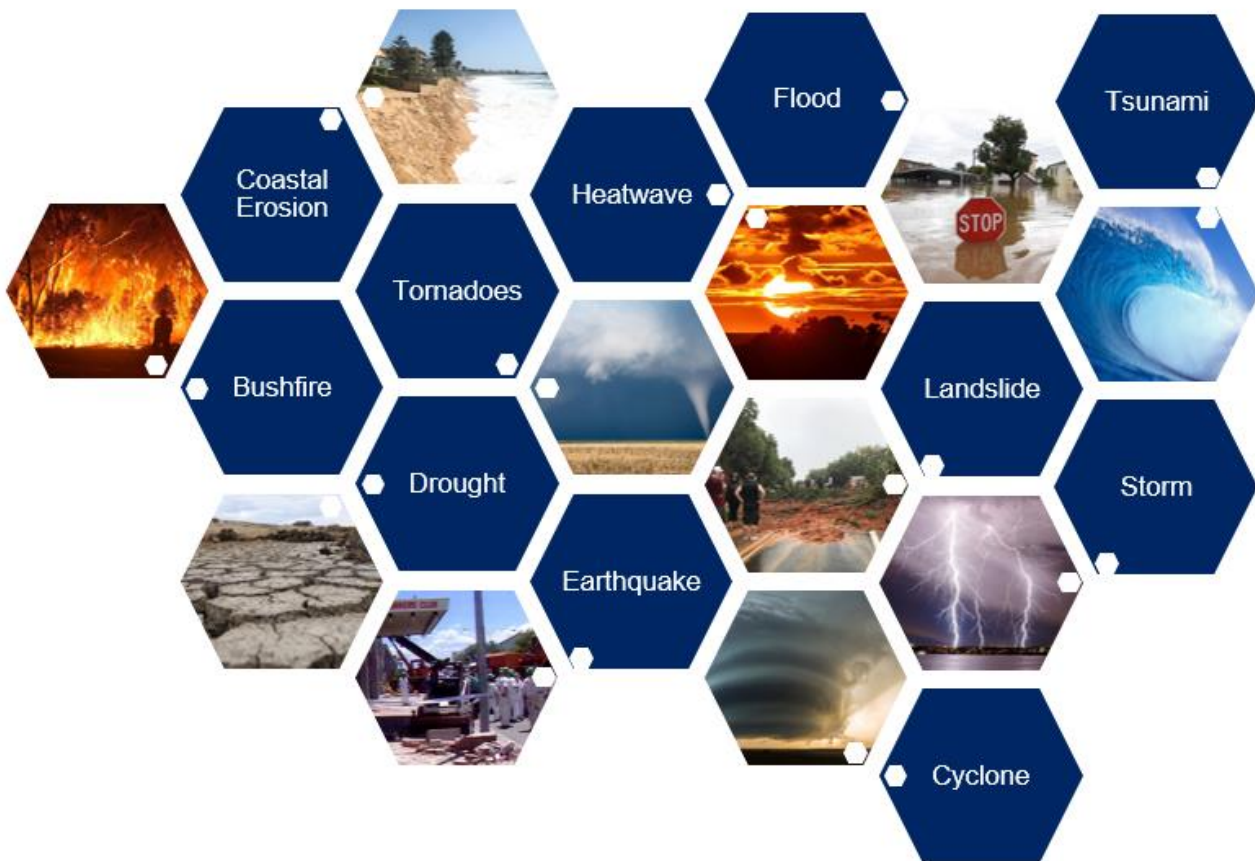
Figure 2. Shows the natural hazards that are included in the Guide

The Strategic Guide to Planning for Natural Hazards covers natural hazards identified as posing a high or extreme risk to NSW 1 . It also covers natural hazards that are considered to pose a risk due to the effects of climate change. Figure 2 shows a graphic of the risks considered.