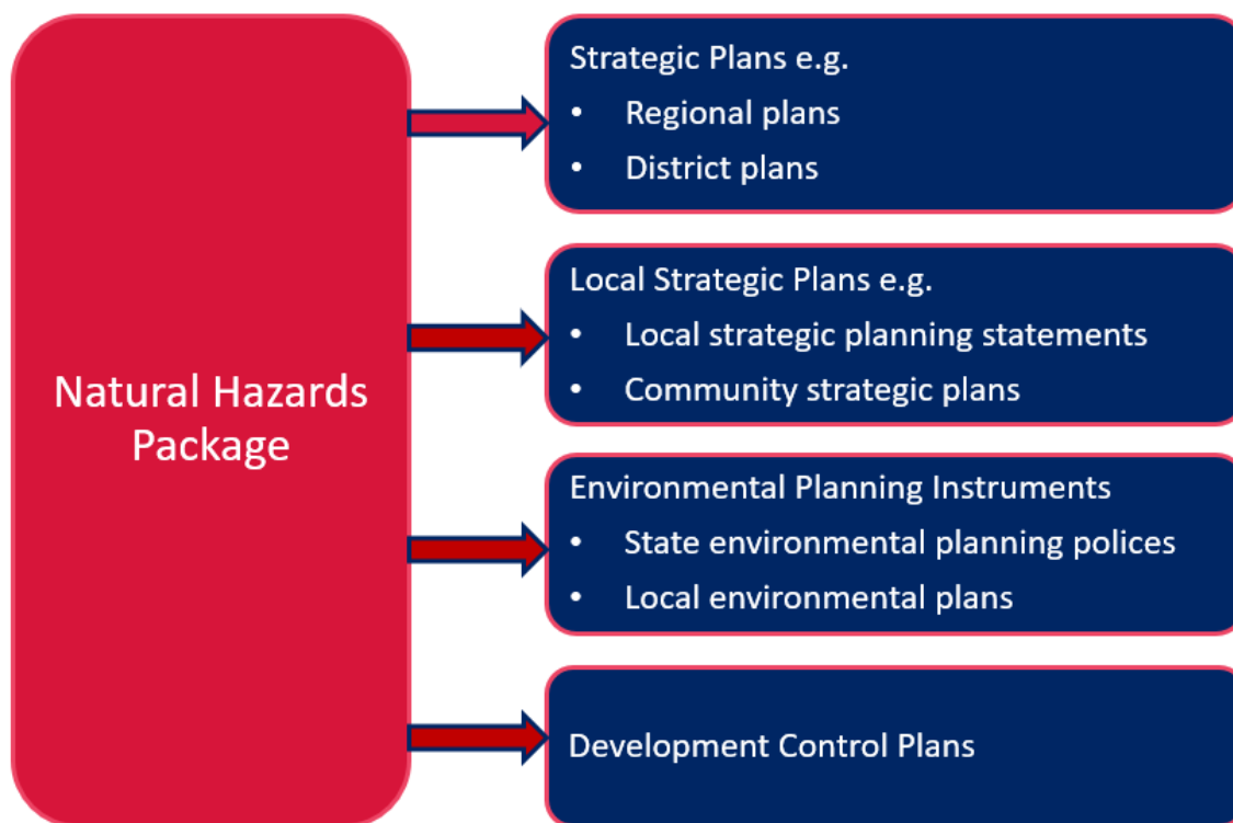
Figure 1. The Natural Hazard Package and the NSW Planning Framework

A resource kit has been developed to help planning authorities find the natural hazard information they need. Figure 1 outlines where the guide and resource kit (which together are known as the Natural Hazards Package) fit into the planning framework.