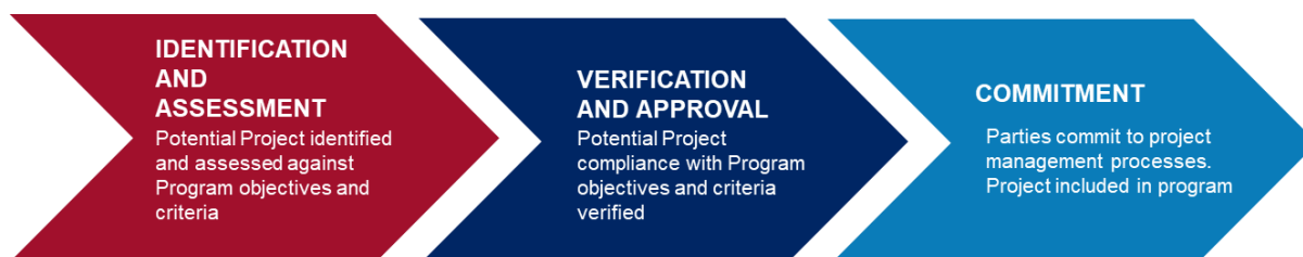
Figure 1 Project Selection Process

Selected projects will be monitored to ensure they continue to align to program objectives.