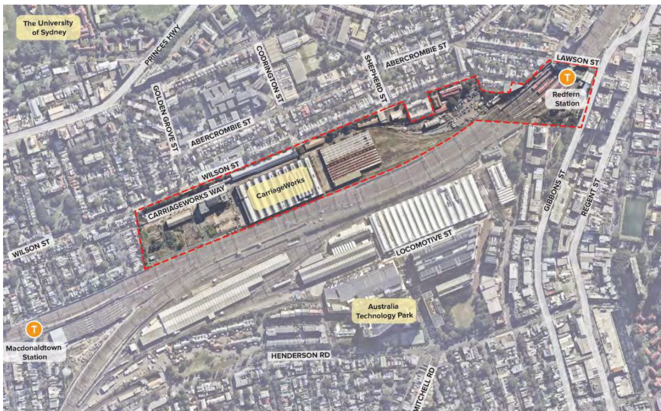
Figure 1: Redfern North Eveleigh Precinct Study Area

The Study Requirements outlined in this document will guide TfNSW's investigations into any new or updated planning controls that are proposed within the Redfern North Eveleigh Precinct shown in Figure 1 . The Study Requirements apply to the Precinct and will inform the preparation of new or updated planning controls. It is noted that changes to planning controls may not be required for all parts of the Precinct however this needs to be addressed by the Place Strategy, technical studies and associated SSP documentation.