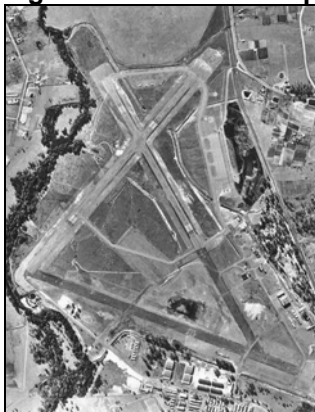
Figure 4-4 Historic photograph of runways (1970's)

The retention of the runways on the eastern side of the north-south sub-arterial road is more difficult due to the footprint of future residential development and would be difficult to retain. The ILP seeks to promote a street pattern which reflects the former location of the main runways.