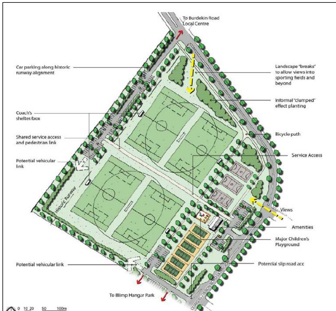
Figure 4-1 Schofields sports fields