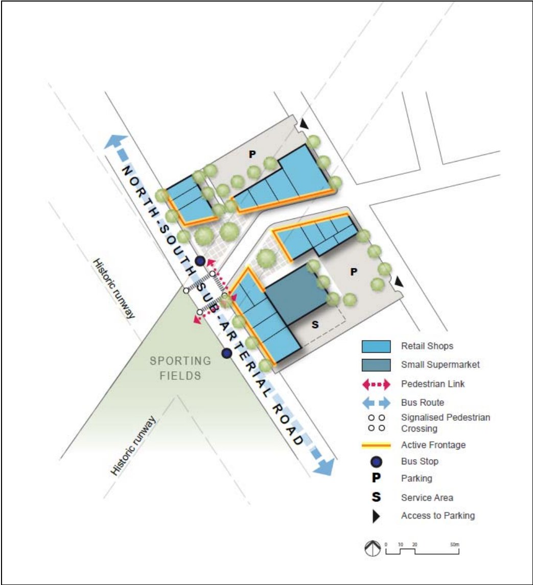
Figure 4-3 Burdekin Road local centre

The Grange Avenue neighbourhood centre remains unchanged.