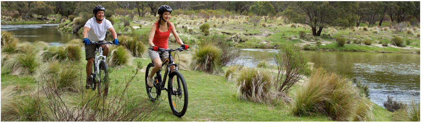
Kosciusko National Park – Destination NSW