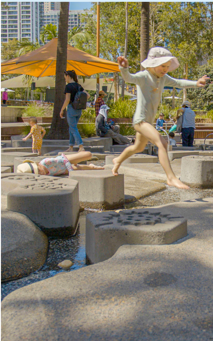
Tumalong Park - Destination NSW

Places to Play is about providing access to activities that have previously been considered extreme sports in public open spaces.