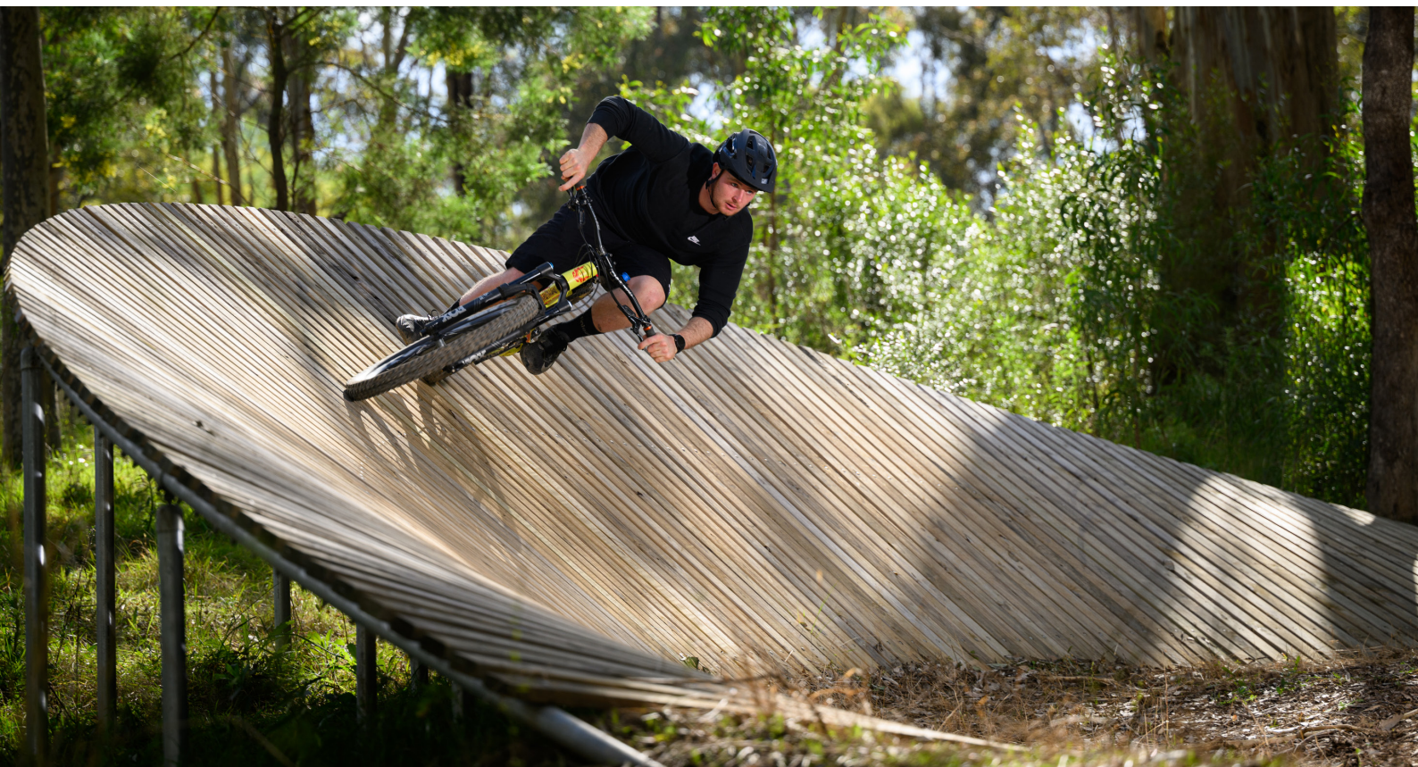
Wyld Mountain Bike and BMX - Western Sydney Parklands