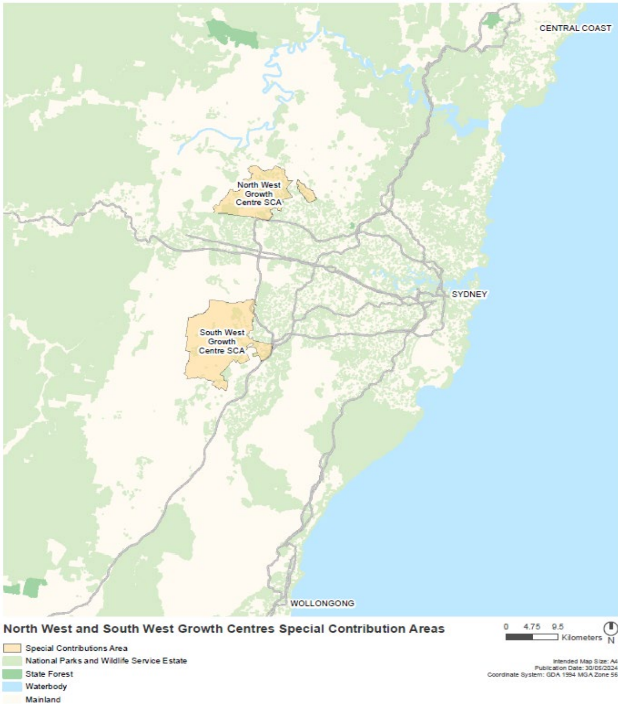
Figure 1. Map of the Western Sydney Growth Areas Special Contributions Area

For this round, the Special Infrastructure Contributions Funding Program will provide up to $75 million in funds to support the delivery of infrastructure in the Western Sydney Growth Areas Special Contributions Area (see Figure 1).