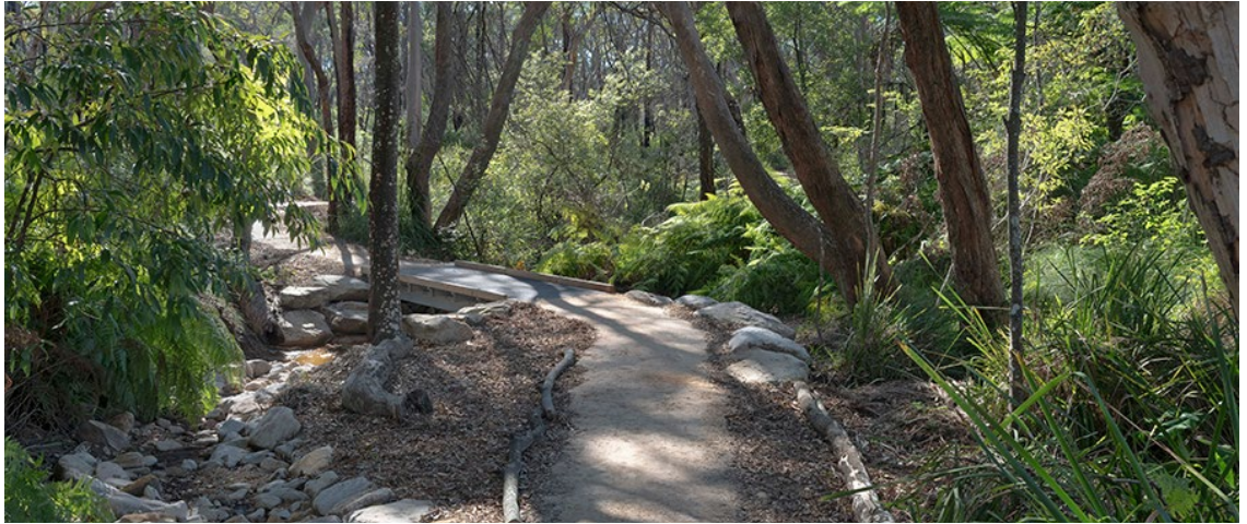
The upgraded park in Nandi reserve has over 1.2km of pathways to provide an extensive walking trail.