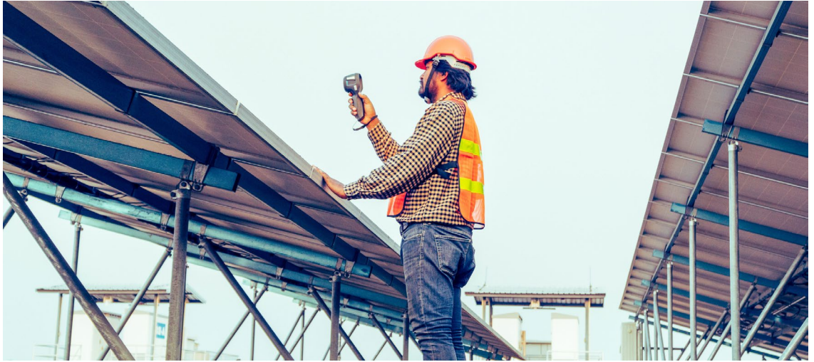
A technician inspecting solar panels