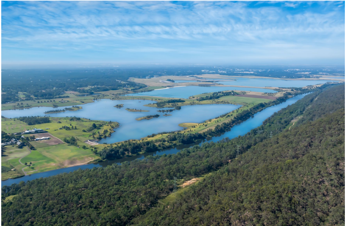
The Nepean river in the Cumberland Plain.

$600k awarded to fund Aboriginal businesses