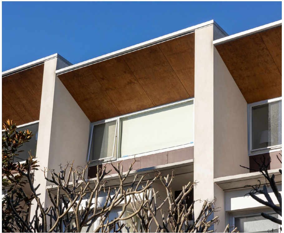
Apartments in Sydney

dwellings unlocked through local rezonings