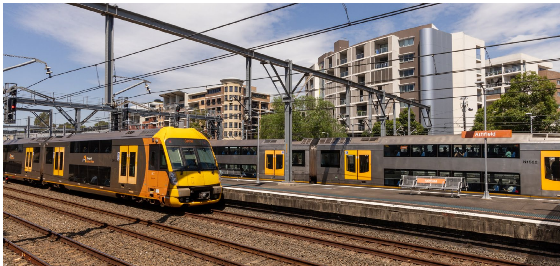
Ashfield train station