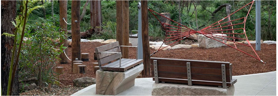
The new nature-based play space at Nandi Reserve in Frenchs Forest.

projects funded to create spaces for skating, scooting and riding